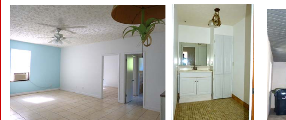
Ground Floor Guest Apartment