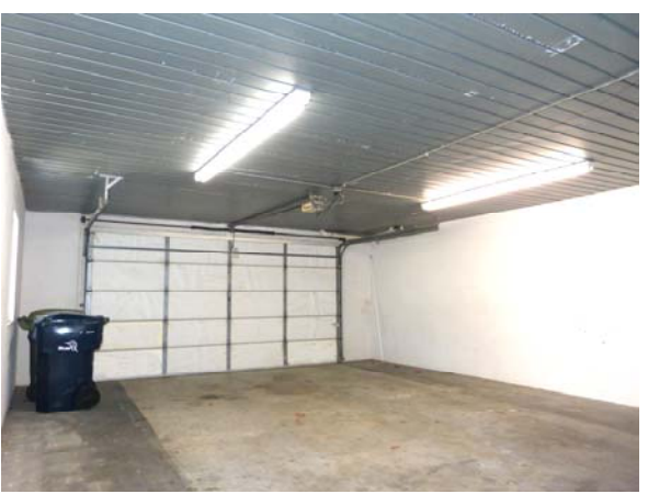
Garage & Breezeway